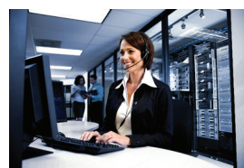
Monitoring station (optional)

To download your Mobile TTE Application: