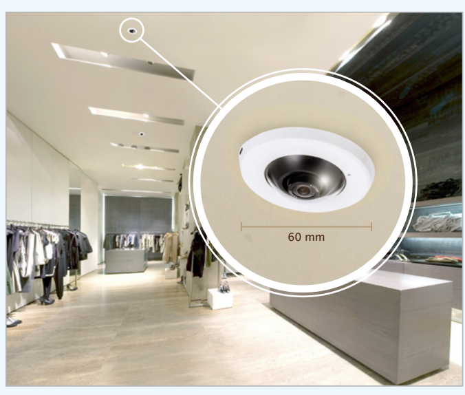
The Stylish Recessed-Mount Fisheye Network Camera