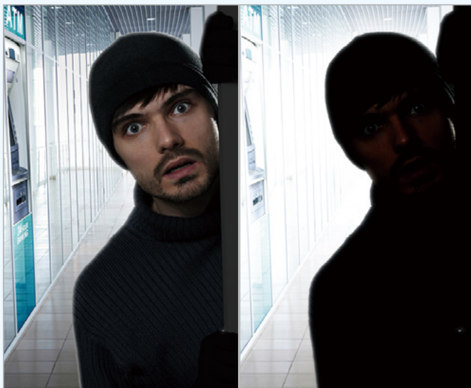
With WDR Pro