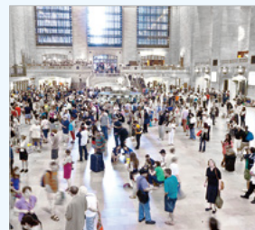
Main Station Lobby