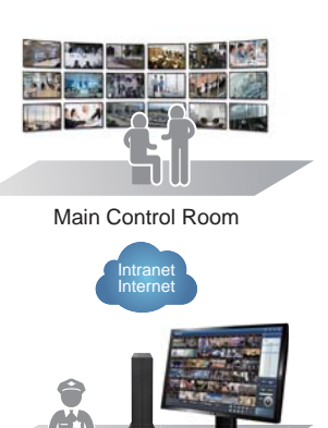
Secondary Control Room